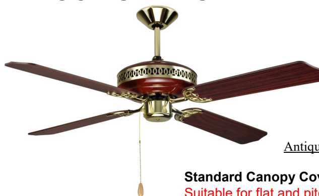
Antique Brass with Rosewood blade